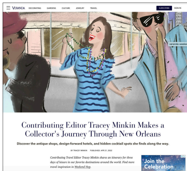
VERANDA Weekend Hop Example

In partnership with African American Cultural Heritage Action Fund, VERANDA is raising awareness and funding for the preservation of historic properties throughout the country via an ongoing series of features on historic sites.